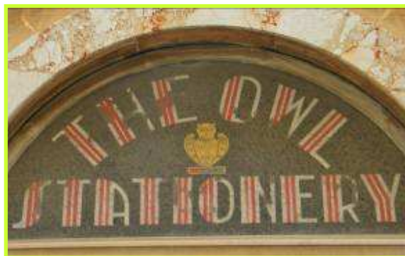
3. a stationery