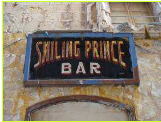
2. an old pub