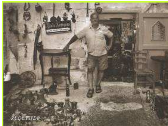
'ir-regattier' (an old shop selling antiques and other collectibles)

This shop was quite popular in the _____ days. One would find many cheap stuff selling for very _____ prices. Some people used to buy old pieces of furniture from this shop, in order to restore it themselves.