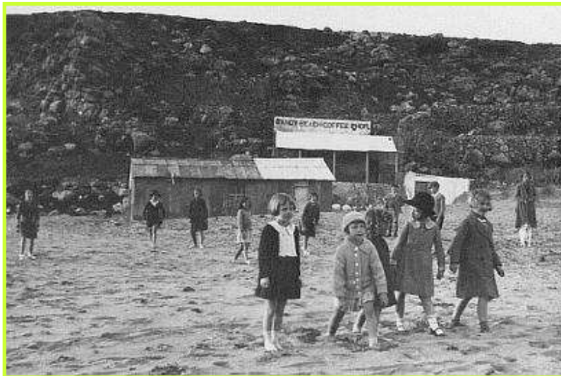
1. a beach kiosk

You may write about the building itself, the products one would find from such a shop, who would do the shopping from such a shop etc.