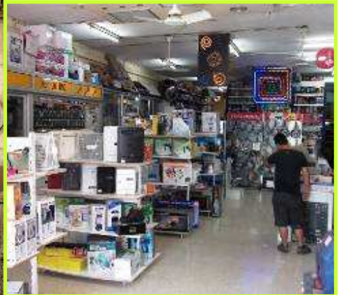
the old ironmongery