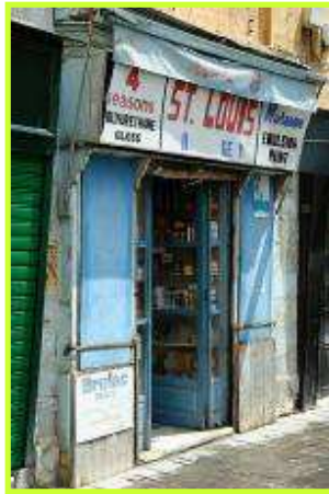
4. an ironmongery