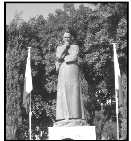
A monument for Dun Karm Psaila in Floriana

1. Mention one reason why you think the Maltese people felt the need to have a monument dedicated to Dun Mikiel Xerri and his friends in Valletta.