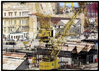
The shipyards for ship repairs.