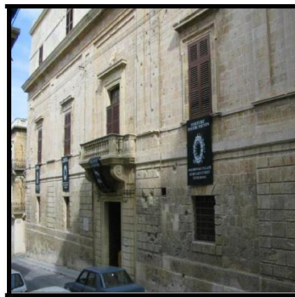
The Inquisitor's Palace