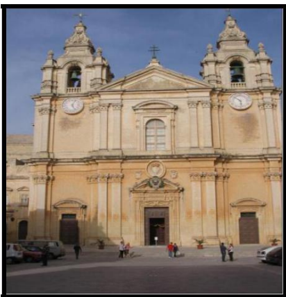
The Cathedral of St Paul