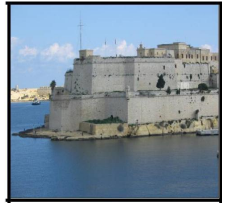
Fort St Angelo