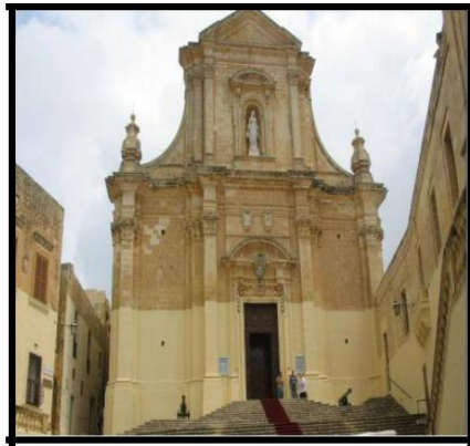
The Cathedral of Saint Mary