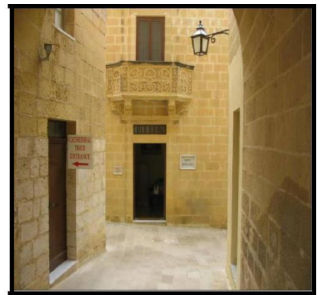
A narrow road in Gozo