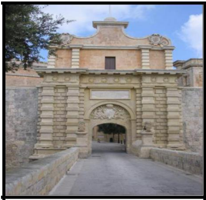
The Door of Mondion

VITTORIOSA, MDINA or the CITADEL under each photo. Each city needs to be written twice.