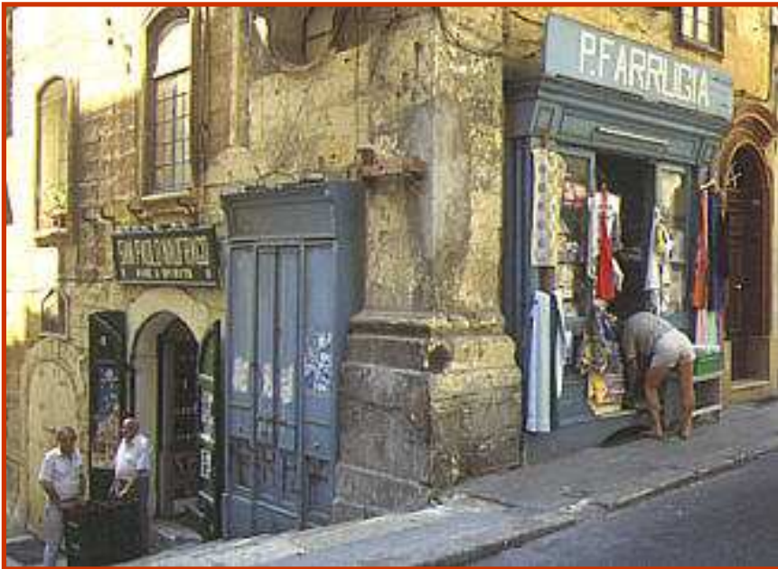
an old clothes' shop