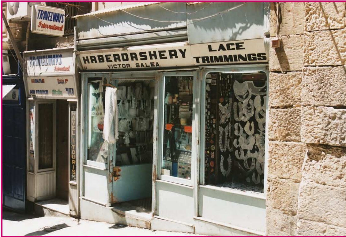
an old haberdashery

C. What questions would you ask old people about Maltese shops in the past?