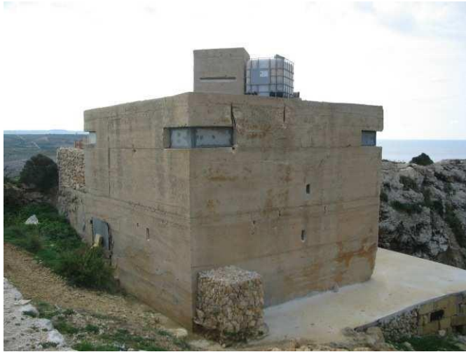
2: THE PILLBOXES

A: Compare the photos with the sentences by writing the number of the photo in the correct box.