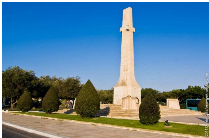
4: THE MONUMENT OF WAR