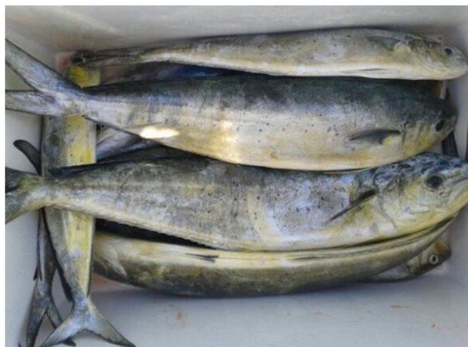
Lampuki (dolphinfish or dorado)

The types of fish also caught in the lampuki season are pilot-fish , lesser amberjack and tuna .